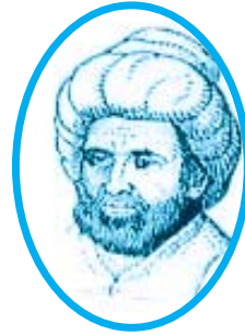
Muhammad ibn Musa al-Khwarizmi (A.D. 780 – 850)

A lemma is a proven statement used for proving another statement.